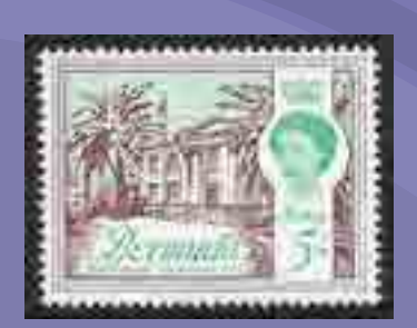
Lot 551 Est £650