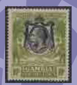
Lot ex 1122 Est £85