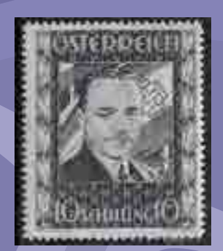
Lot 413 Est £410

All bids to AVH Stamp Auction, PO Box 569, Welwyn Garden City, Herts, AL7 9NP Tel: 07938 601513 Email: info@avhstampauctions.co.uk