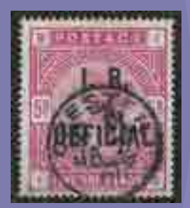
Lot 3091 Est £750